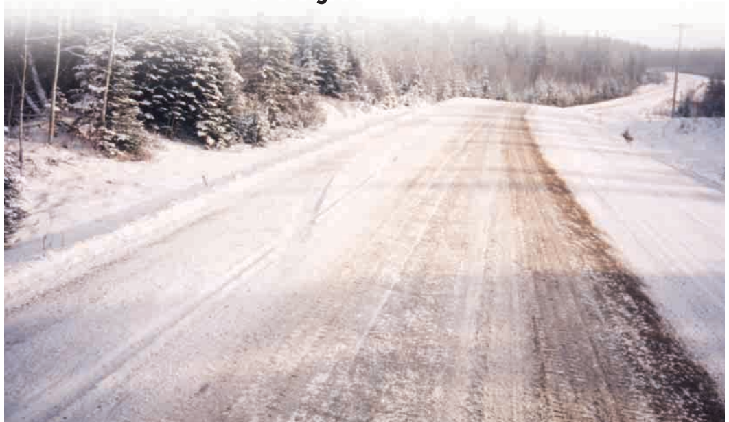
Pre-wet sand: one of the technologies MTO is testing to improve winter driving conditions.

N ow that winter is here, the Ministry of Transportation will be testing new innovations to improve the quality of service and reduce costs in maintenance operations. Road Talk highlights what's being evaluated for the 2004-2005 testing season. This season, testing is being done at selected locations in all five of MTO's Regions.